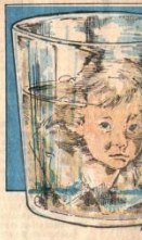
East Bay, Calif.